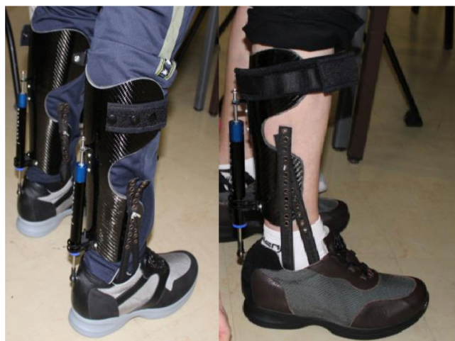
Figure 2. The PD-AFO. The AFO composed of two main parts: The calf part & the Spring cylinder and the orthopedic shoe.